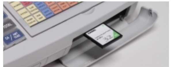
• CF card interface for fast, simple data transfer