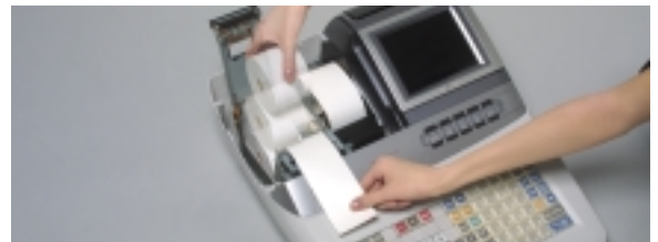
• Drop-in paper-loading for quick, easy paper roll changes